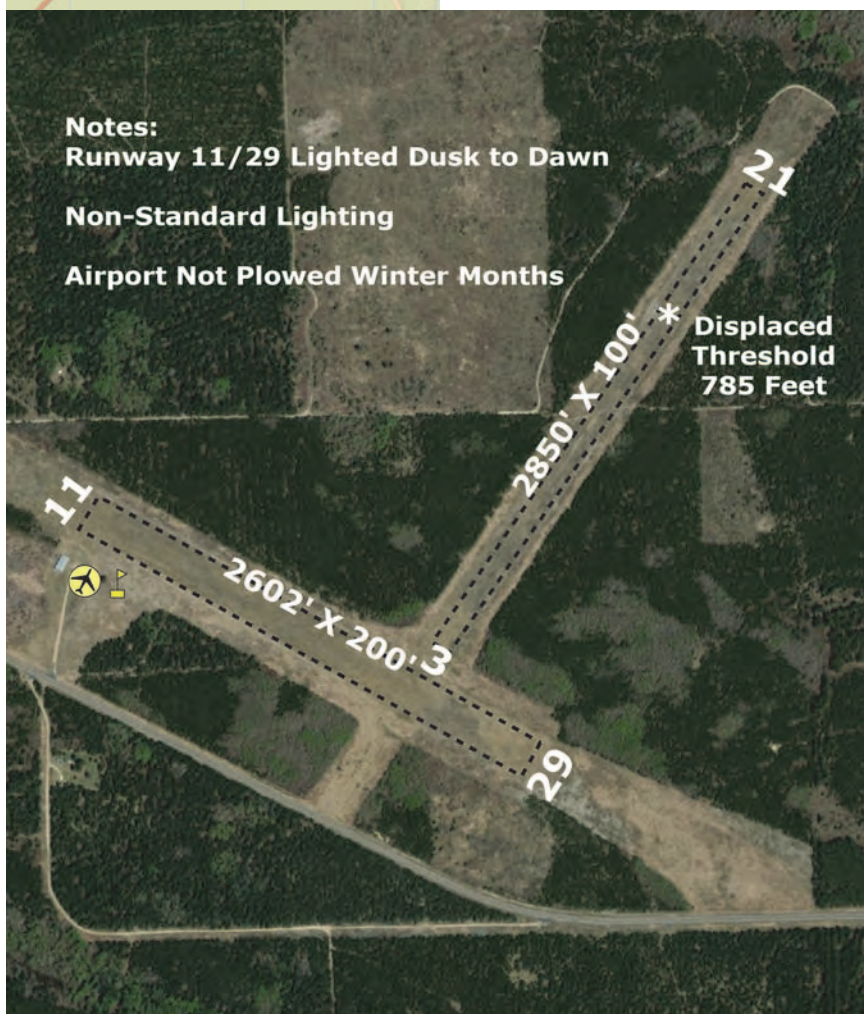
Big Falls Municipal Airport