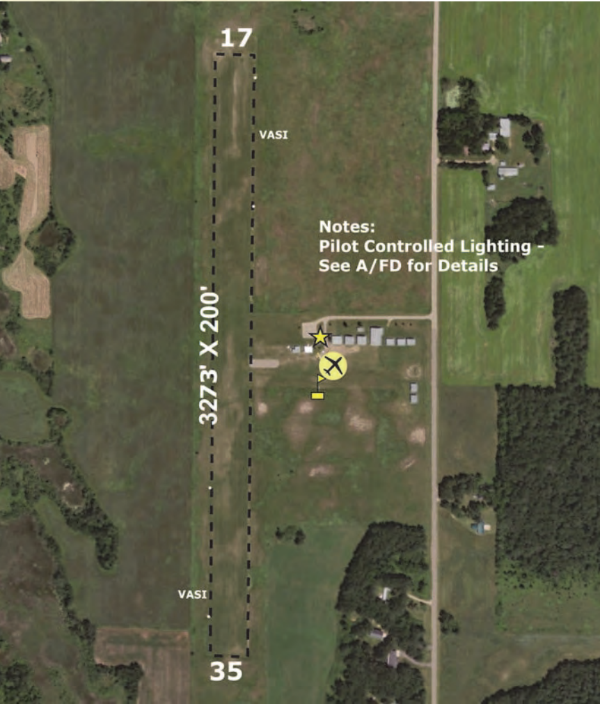
Henning Municipal Airport